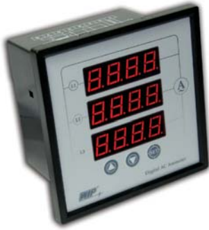
W-DA303 Digital AC Ammeter 3Ø Code : 3203